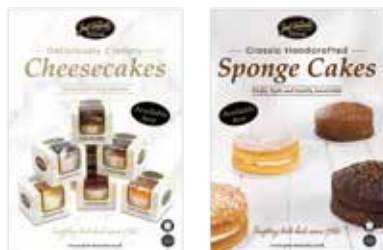
A4 Posters Sponge Cakes & Cheesecakes

For more information on ordering yours, please speak to our office team or your sales representative today.