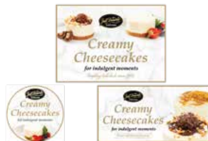
A6 Cheesecake Freezer Fin, Shelf Wobbler and Shelf Talker