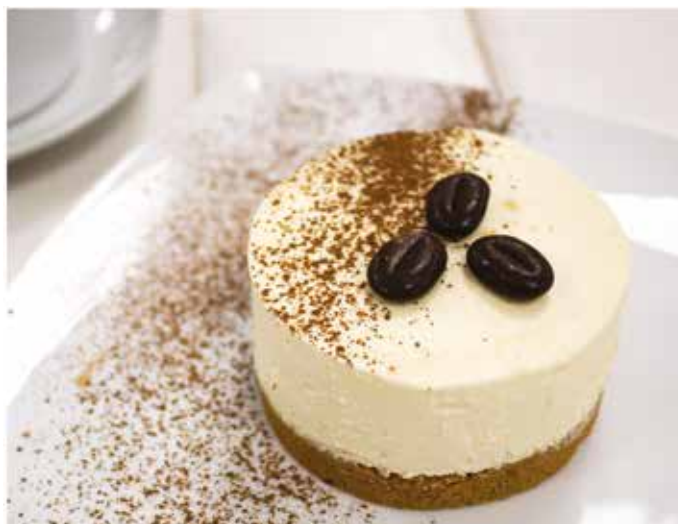
Decoration theme: Café