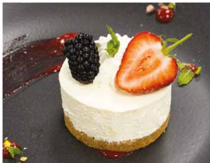
Decoration theme: Restaurant