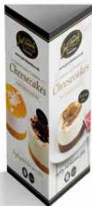
Cheesecake Table Talker