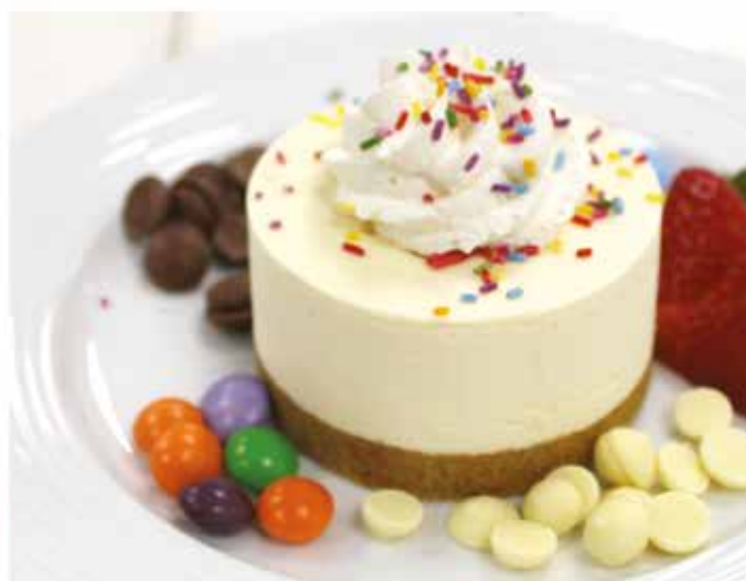
Decoration theme: Children's Party