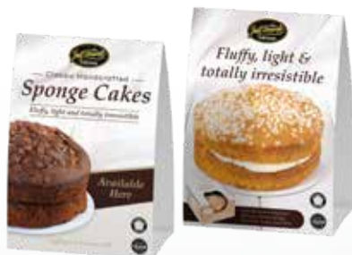
Sponge Cake Tent Card