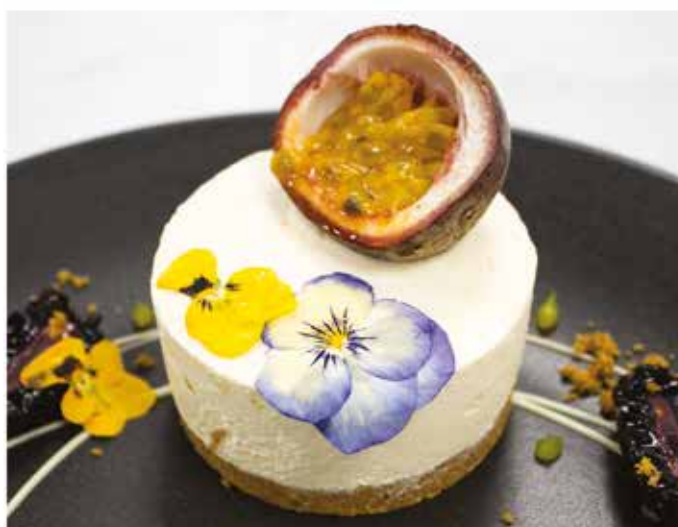
Decoration theme: Wedding